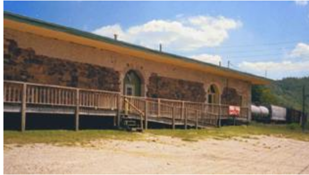
The Ringgold Depot

Shown at left as it looks today, it was the anchor point of Gen. Cleburne's defense. This building was used to host one of the dinners at the 2004 SCV Reunion in Dalton.